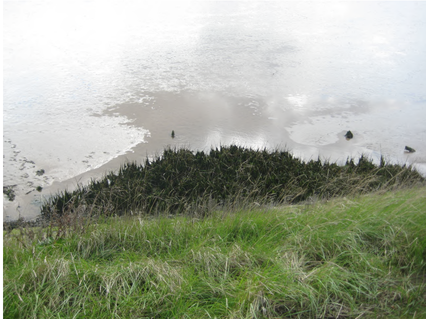
10. 395497 Start of marram grass no hardcore