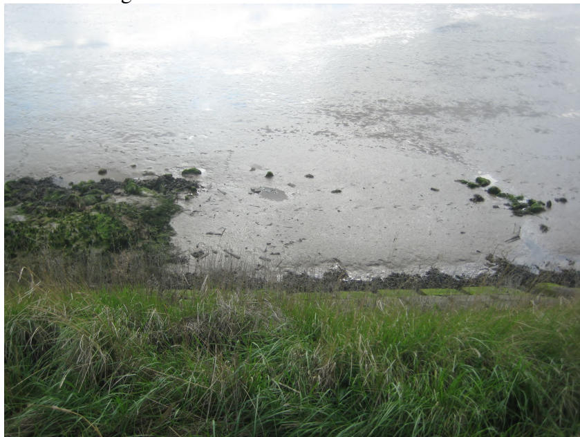
11. 396496 Marram Grass at toe difficult to establish whether this is alive hardcore baffle behind.