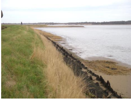
568418 Armour ok but no saltings