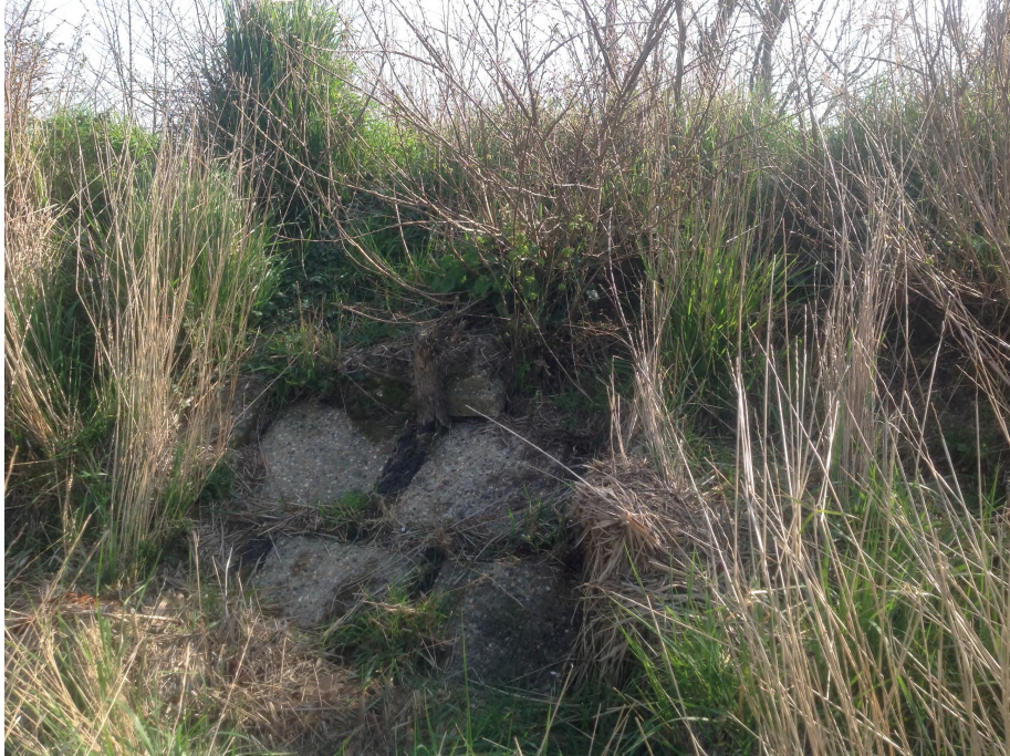
Picture 4: TM4121 5625 looking ESE Surge debris some 600mm below wall crest