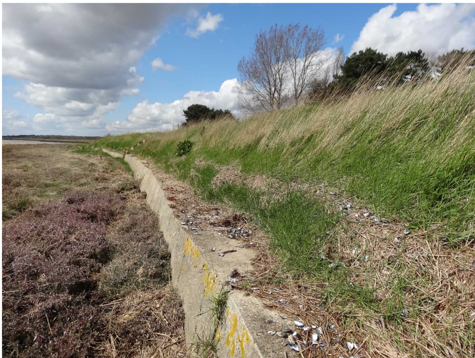
Borrow ditch with fresh water and surrounding levee at south sid of Hazlewood Marshes. TM442573