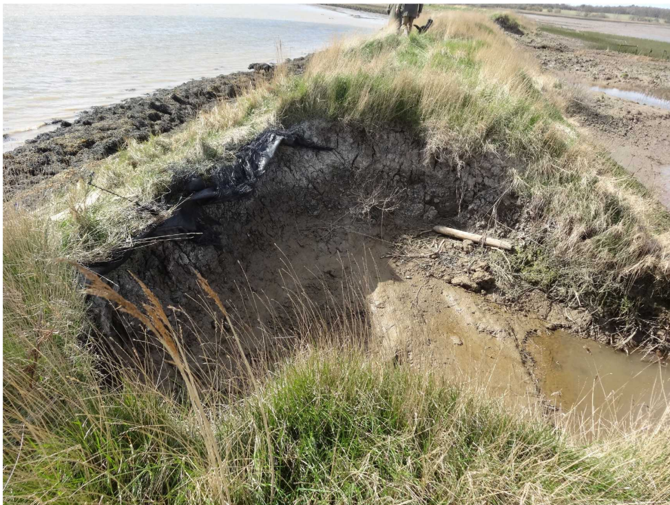
Hazlewood Marshes breach with widened channel. TM440571